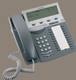
Dialog 4225 Vision