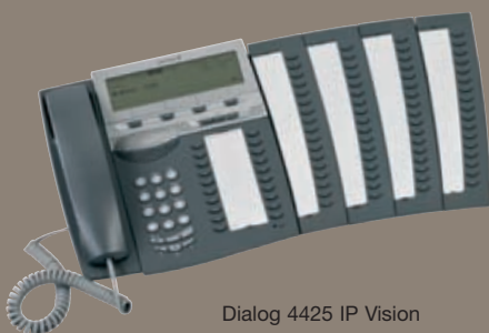
Dialog 4425 IP Vision

For users connected to the MX-ONE™ Telephony Switch, the following will be available: D.N.A. user applications, such as Ericsson Communication Assistant — the web tool for telephony management, Ericsson Communication Client — an advanced PC softphone and Personal Assistant for Sony Ericsson P9XX or the Mobile Extension Client — the tools for enterprise telephony management on mobile phones running Symbian OS.